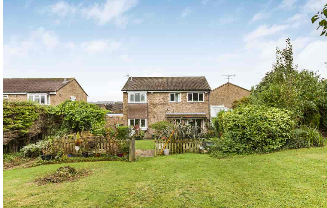
16 Redshots Close, Marlow, Buckinghamshire SL7 3LW Offers in Excess of £950,000 - Freehold