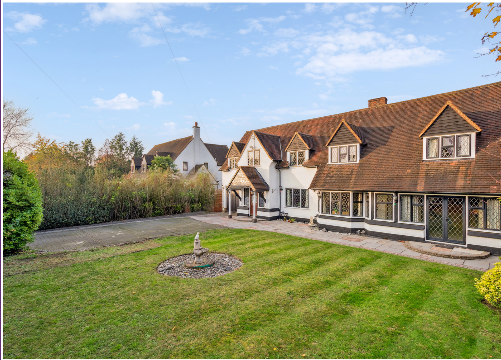
Magnolia Cottage Elm Close, Farnham Common, Buckinghamshire. SL2 3NA.

HILTON KING & LOCKE SPECIALISTS IN PROPERTY