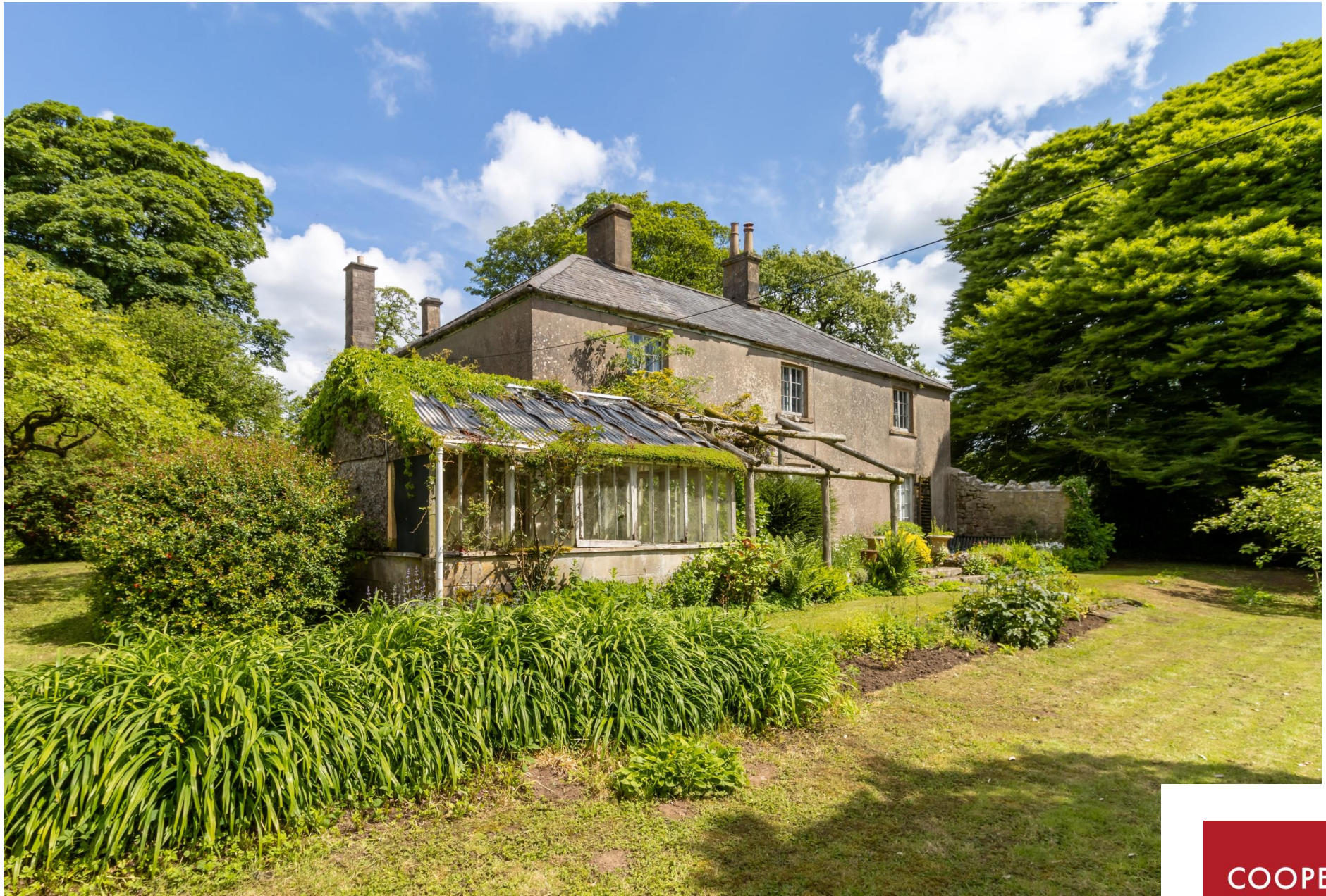
Cranmore Cottage, East Cranmore, BA4 4SD Auction guide price £550,000 to £600,000 Freehold