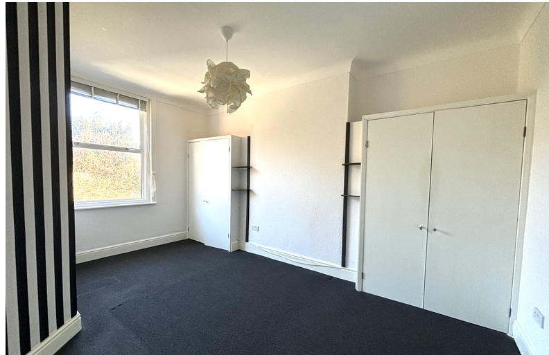
1ST FLOOR 602 sq.ft. (56.0 sq.m.) approx.