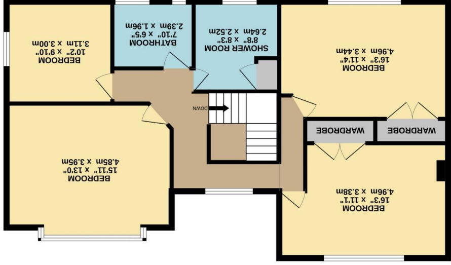
947 sq.ft. (88.0 sq.m.) approx.

TOTAL FLOOR AREA : 1968 sq.ft. (182.8 sq.m.) approx. Whilst every attempt has been made to ensure the accuracy of the floorplan contained here, measurements of doors, windows, rooms and any other items are approximate and no responsibility is taken for any error, omission or mis-statement. This plan is for illustrative purposes only and should be used as such by any prospective purchaser. The services, systems and appliances shown have not been tested and no guarantee as to their operability or efficiency can be given. Made with Metropix ©2024