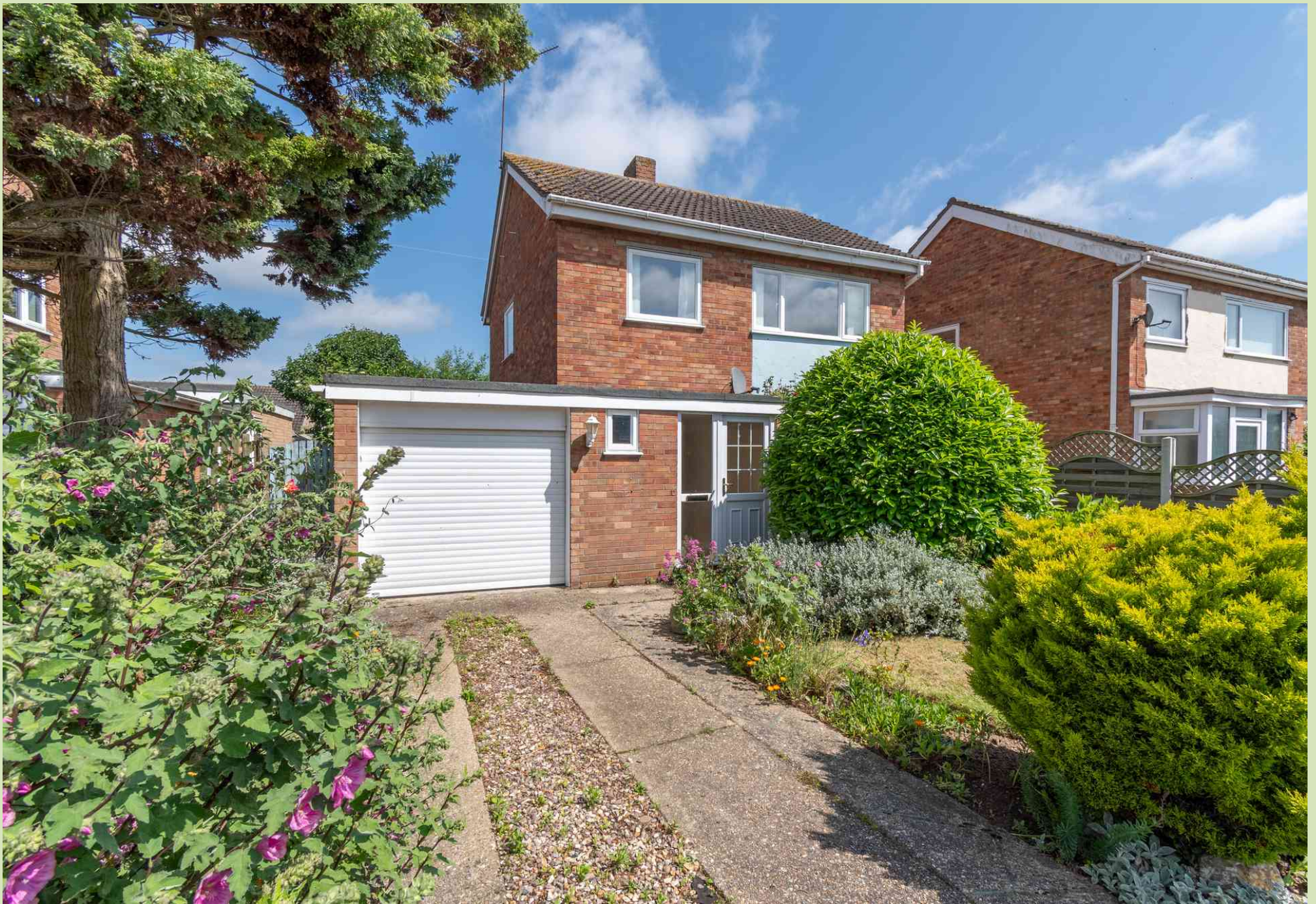
12 North Park, Fakenham Guide Price £280,000