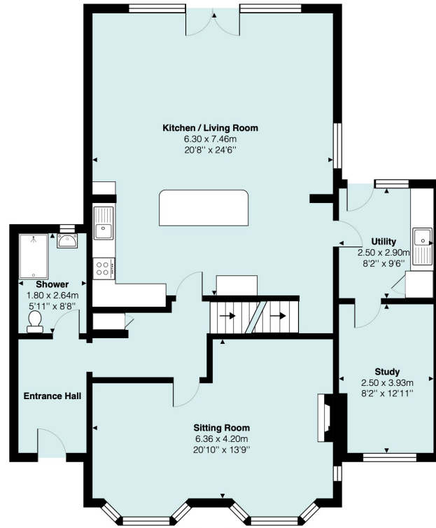
Ground Floor Area: 113.1 m 2 ... 1218 ft 2