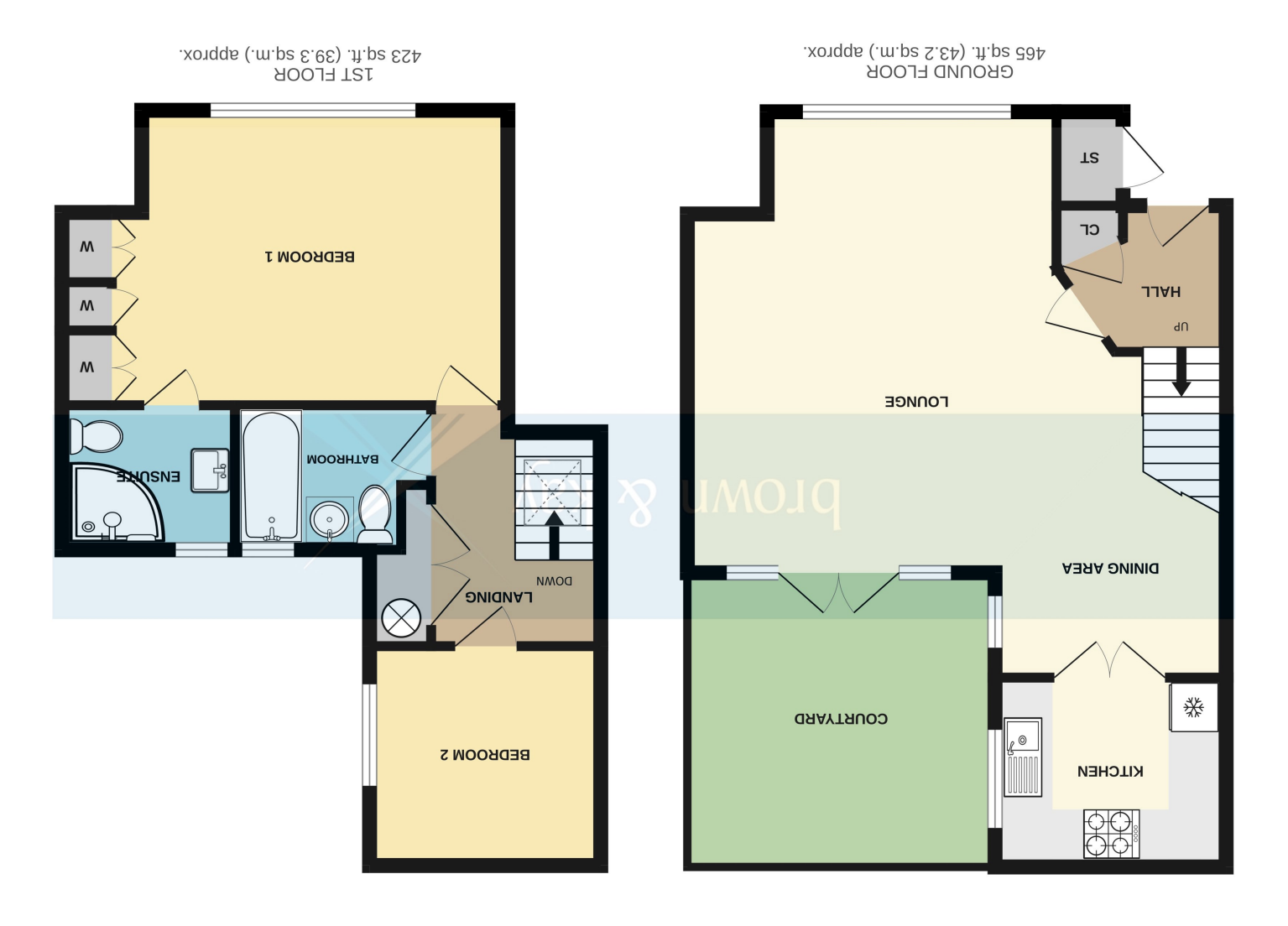
Whilst every attempt has been made to ensure the accuracy of the floorplan contained here, measurements of doors, women and any other fems are approximate and no responsibility is laken for any error, or moission or mis-statement. This plan is for illustrative purposes only and should be used as such by any prospective purchaser. The services, systems and appliances shown have not been tested and no guarantee prospective purchaser. The services, systems and appliances shown have not been tested and no guarantee as to their operations. TOTAL FLOOR AREA: 889 sq.ft. (82.6 sq.m.) approx.