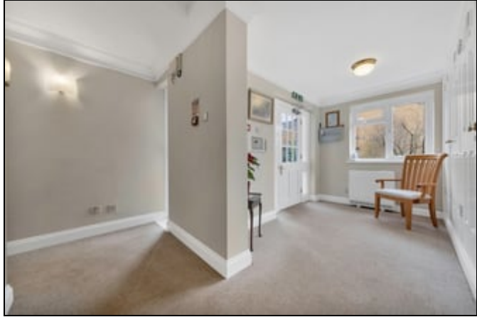
To the flat is by lift or staircase.

From Sevenoaks High Street proceed north through the Pembroke Road traffic lights. Keep left, past the turning on your left (The Drive) and Pavilion Gardens will be found on your left hand side opposite the Vine Cricket Club.