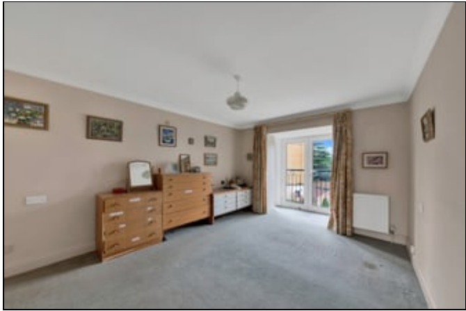
18' 6" x 11' 2" (5.64m x 3.40m) Juliet balcony with double glazed opening doors and double glazed side windows with south westerly aspect, built in wardrobe cupboards with floor to ceiling sliding mirrored doors, coved cornice, double radiator.