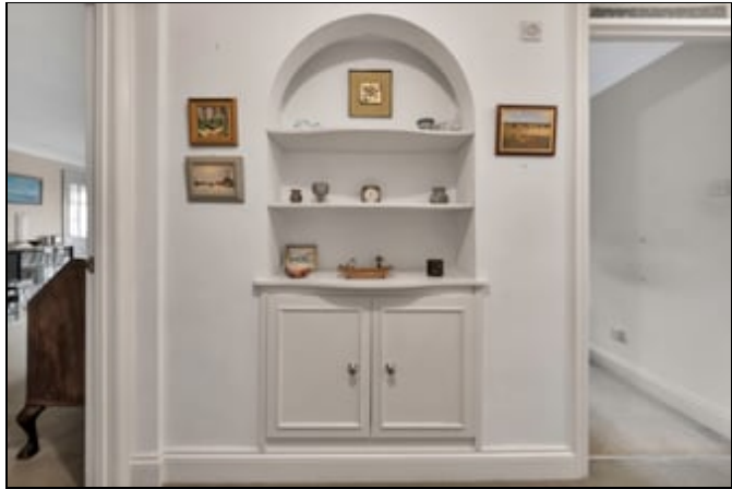
15' 1" x 6' 4" (4.60m x 1.93m) narrowing to 3'1, Built in double coat cupboard, alcove with fitted shelves, downlighting and cupboard under, radiator, entry phone, airing cupboard with modern hot water cylinder.