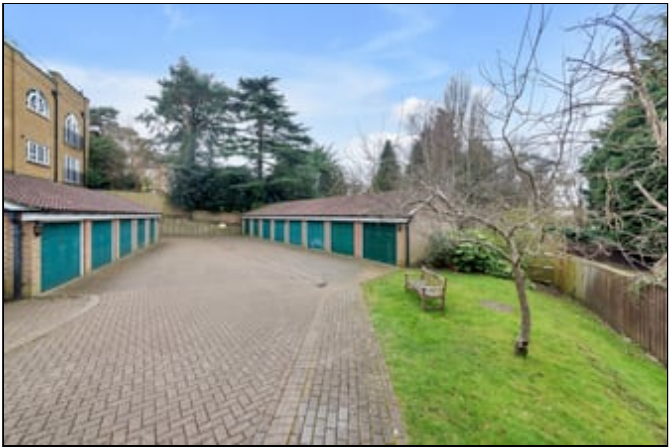
There is a brick built garage with remote electrically operated up and over door, power supply.

Within the block of 13 apartments is a two bedroomed suite on the second floor available to provide guest accommodation for overnight visitors.