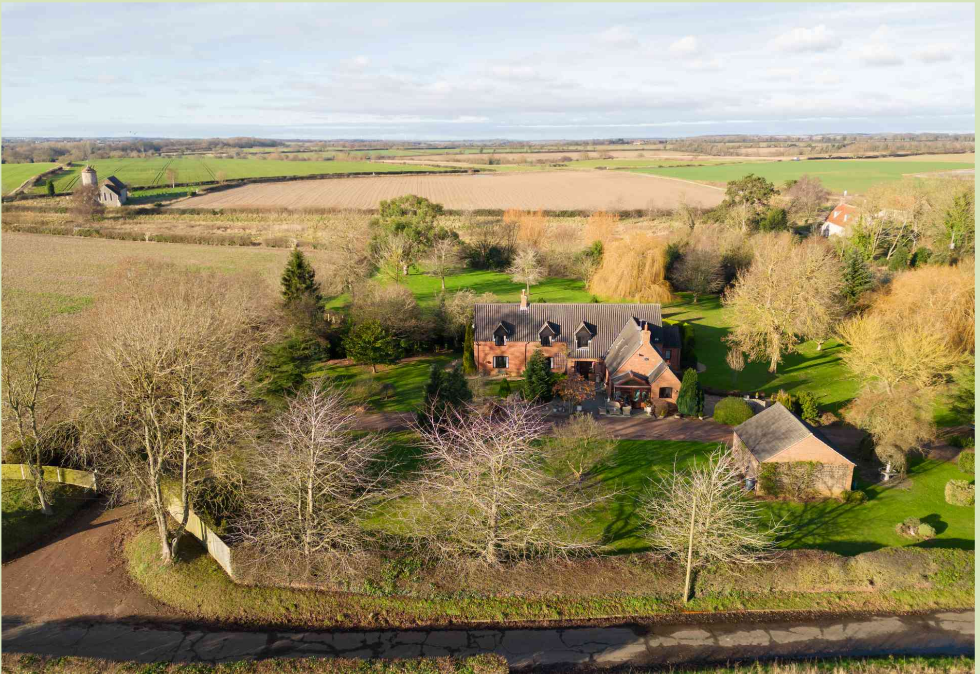
Meadow Brook, Little Snoring Guide Price £1,250,000