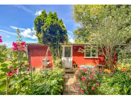
71 High Beech Chalet Park, Battle Road, St Leonards-on-Sea TN37 7BS