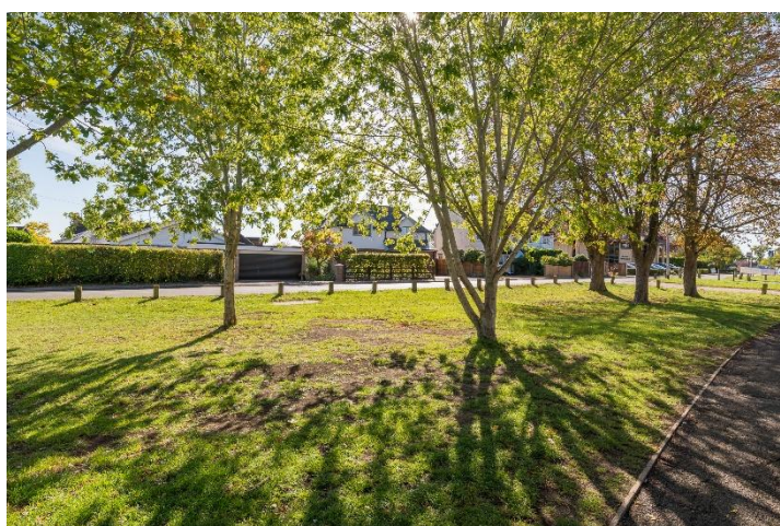
60 Village Road Bromham, Bedfordshire, MK43 8LJ