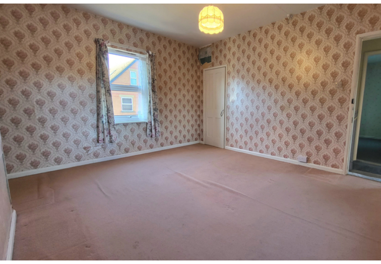
*** FANTASTIC POTENTIAL THROUGHOUT ***" With an extensive rear garden, this 3 bedroom detached home benefits from no onward chain. The home features an entrance hall, 2 reception rooms, cloakroom, kitchen, wet room, large sun room lean to style and 3 bedrooms with an en-suite to bedroom 1. EPC Energy Rating - D/Council Tax Band - C".