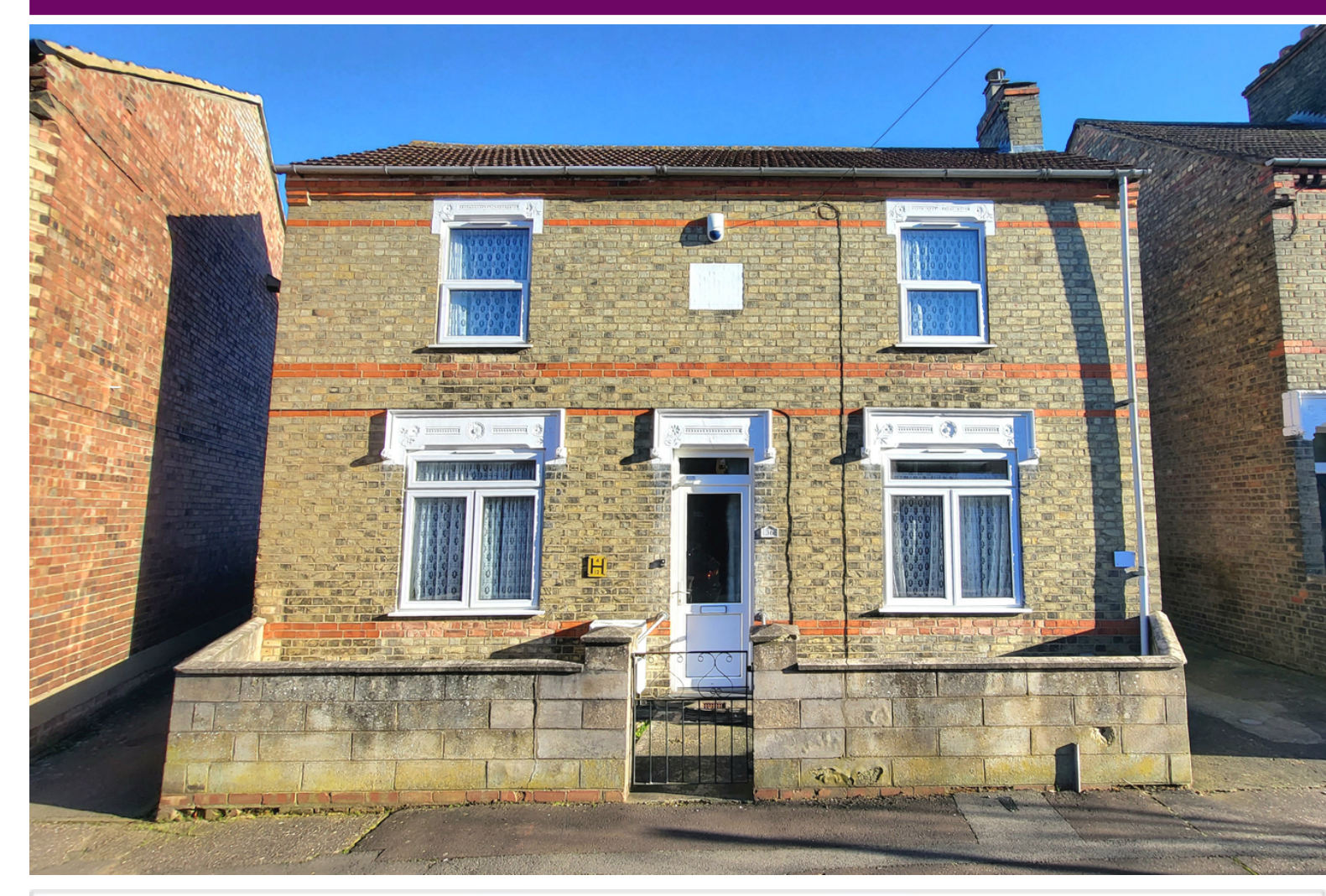
36 Jubilee Street, Peterborough PE2 9PH