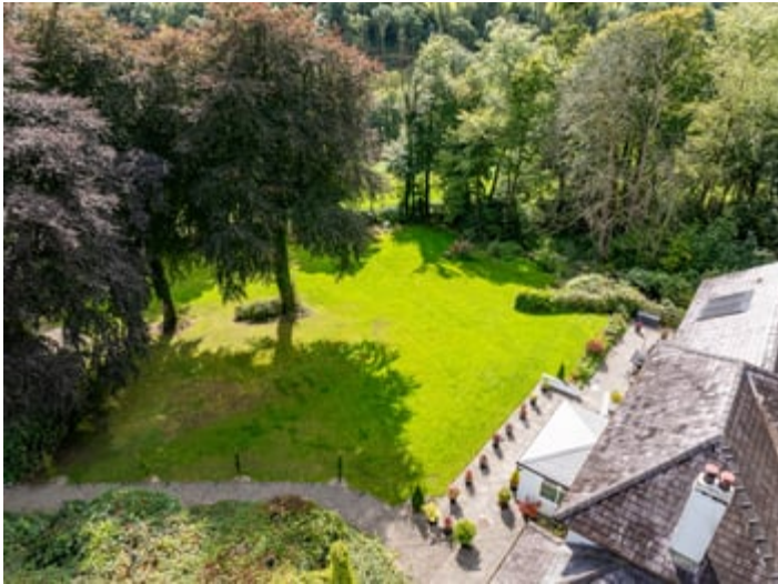
FRONT PATIO AREA

The garden is a haven for local Wildlife being a prime Red Kite territory, Buzzards, various Bird spotting and natural Wildlife within the woodland gardens.