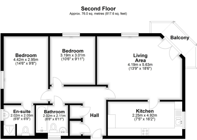
Total area: approx. 76.0 sq. metres (817.6 sq. feet)

Whilst we have endeavoured to prepare our sales particulars accurately none of the services, appliances or equipment have been tested. A buyer should satisfy themselves on such matters prior to purchase. Any measurements or distances mentioned in these particulars are for guide reference only. If such particulars are fundamental to a purchase, buyers should rely on their own enquiries. All enquiries should be directed to Elevation Estate Agents in the first instance.