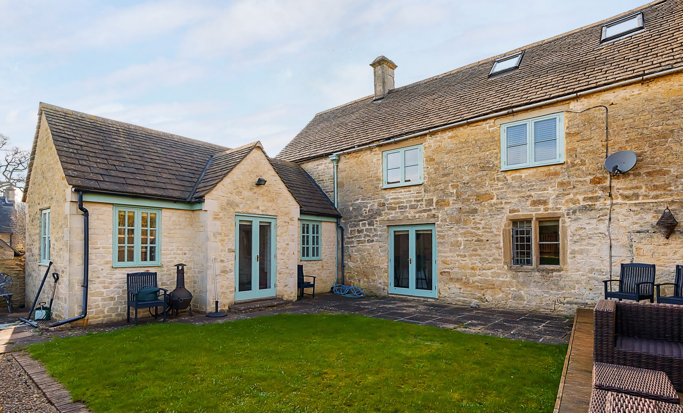
Myrtle Cottage, Old Neighbourhood, Chalford, Stroud, Gloucestershire, GL6 8AA Guide Price £550,000