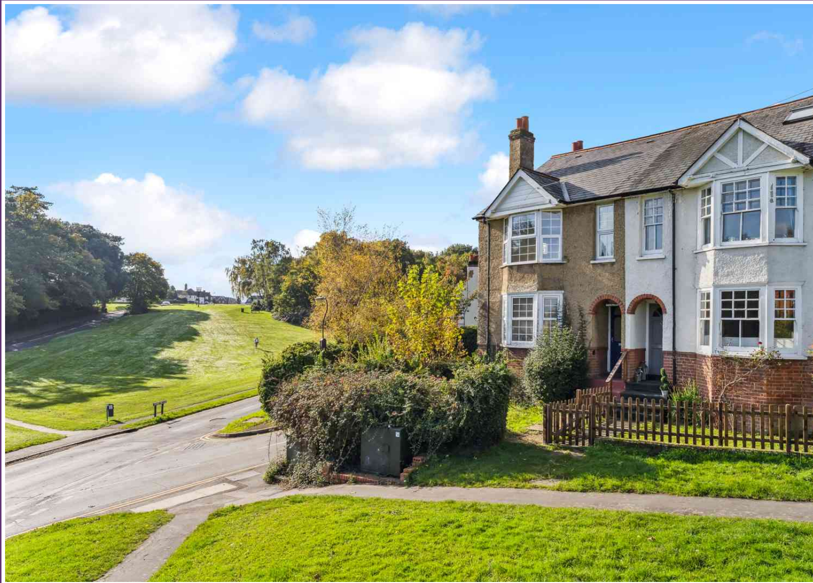
Clock House, Gold Hill North, Buckinghamshire. SL9 9JQ.

HILTON KING & LOCKE SPECIALISTS IN PROPERTY