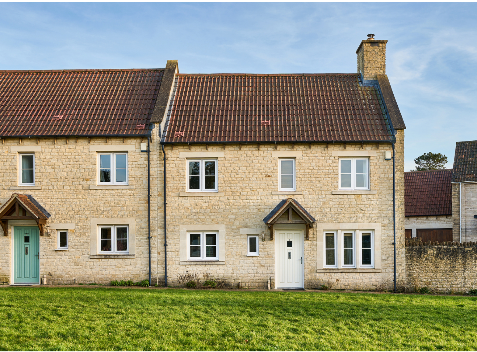
Doynton, Nr Bath