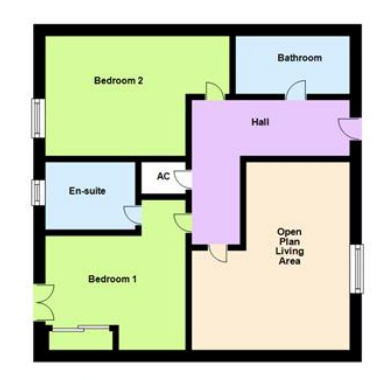
Floor plans are for layout purposes only. Measurements are approximate and subject to inaccuracies Plan produced using PlanUp.