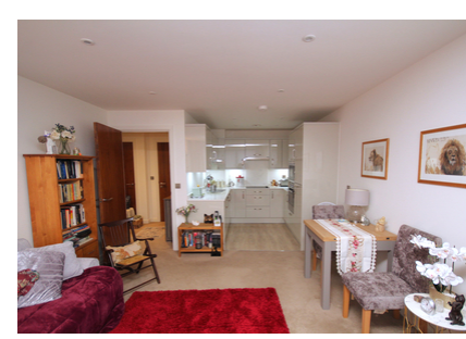
Flat 7 Esprit, 236-244 High Street North, Poole, Dorset BH15 1EA