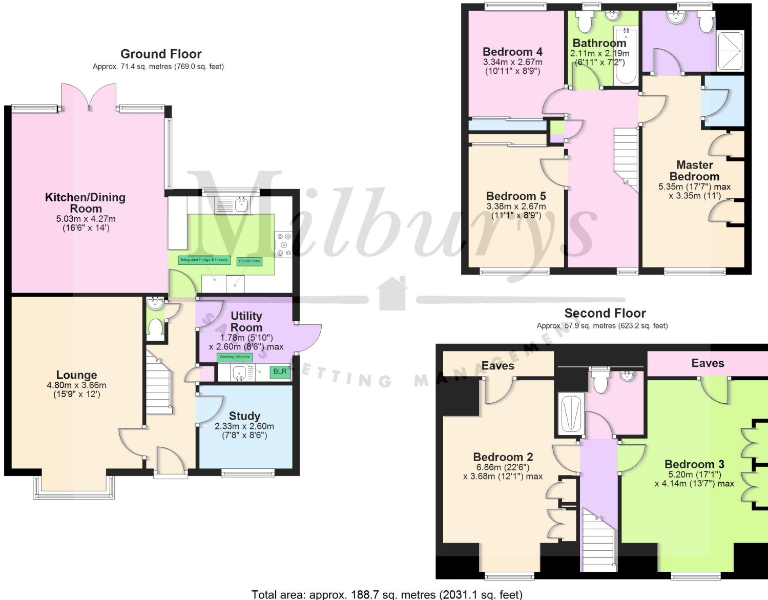
For Illustrative Purposes Only. Not to Scale. Plan produced using PlanUp.