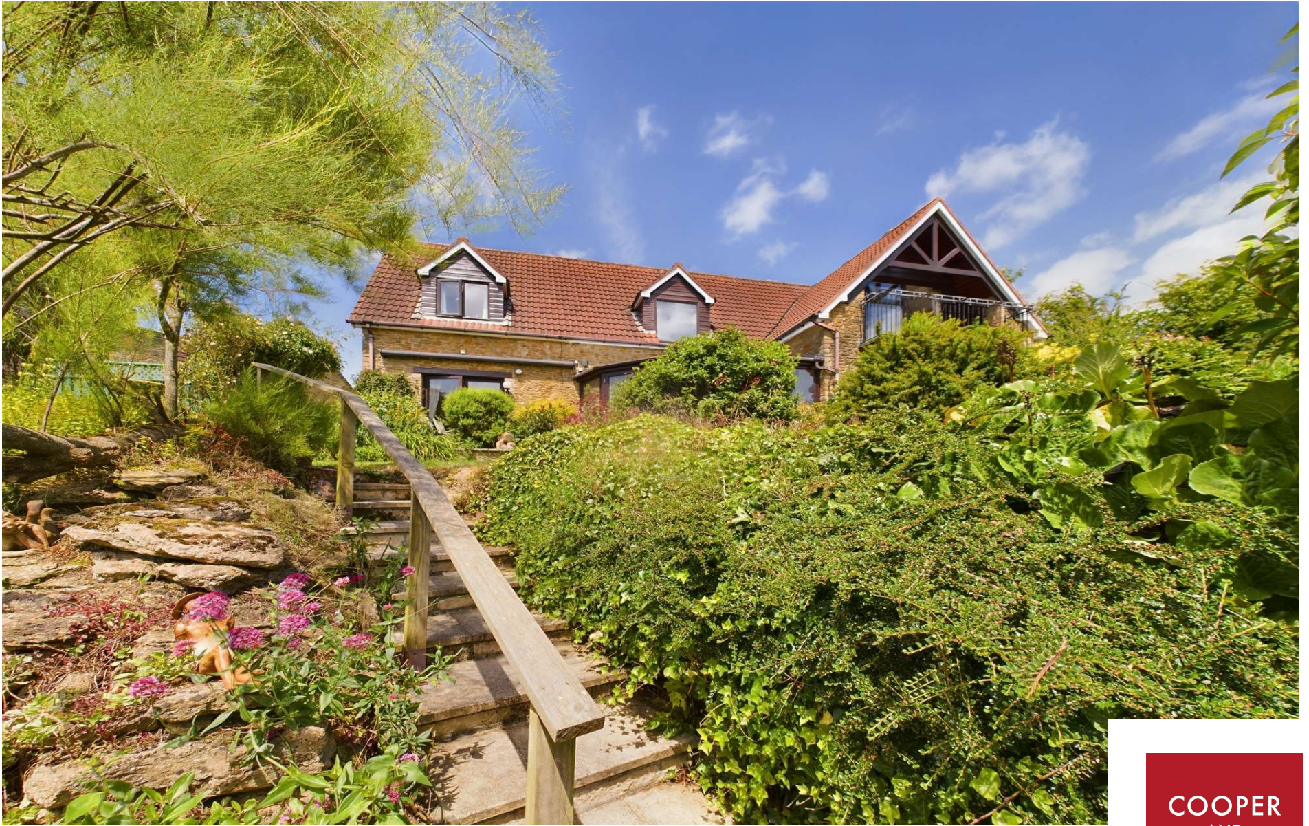
Overcley House, Southfield Farm, Frome, BA11 5LB £825,000 - £850,000 Freehold