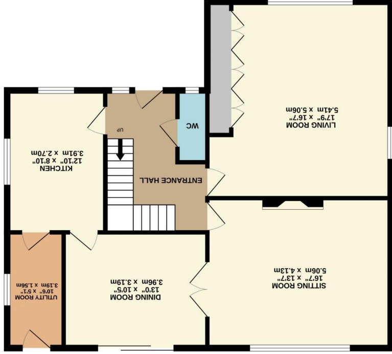
GROUND FLOOR 936 sq.ft. (87.0 sq.m.) approx.