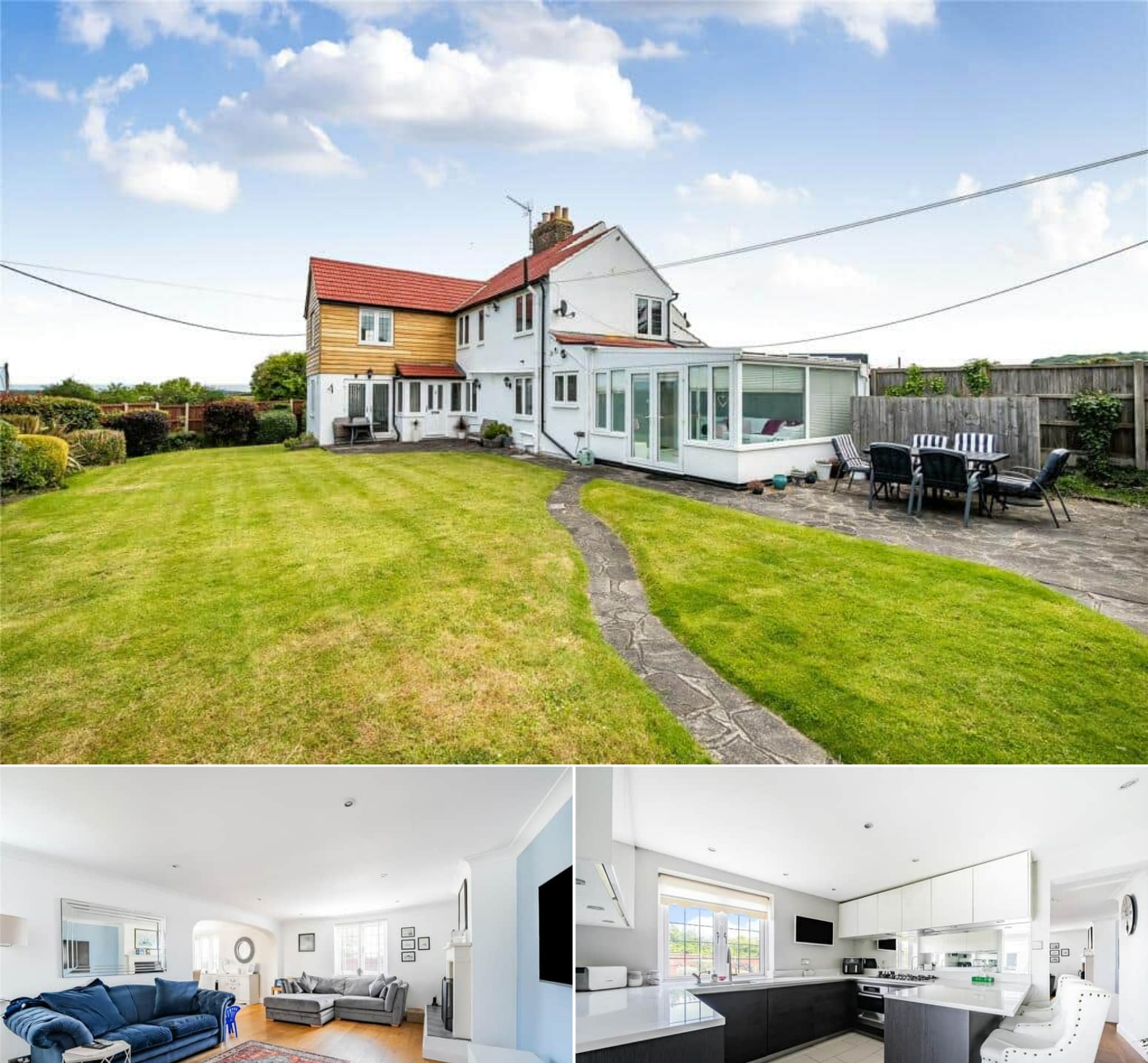
Offers In Excess Of