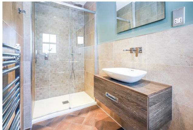
BEDROOM 2 EN-SUITE

FAMILY BATHROOM (10' x 7'3) Four piece suite comprising tiled shower cubicle with rainfall shower and shower attachment, panelled bath with handheld shower attachment, low level WC and vanity unit wash hand basin. Chrome towel rail radiator, fully tiled walls, tile effect flooring, ceiling spotlights and UPVC double glazed frosted window.