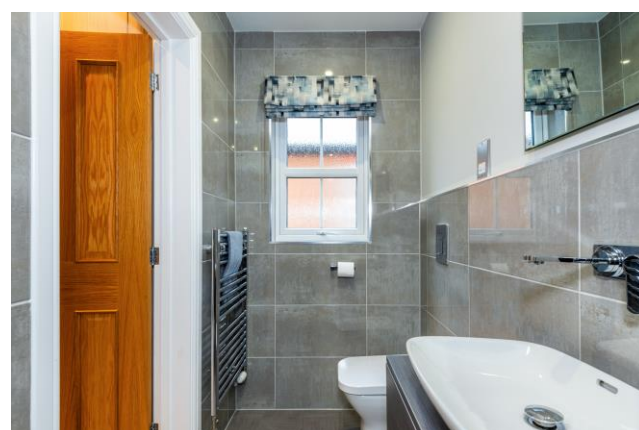
MASTER BEDROOM EN-SUITE

BEDROOM 2 (12' max x 11'4 max) UPVC double glazed window, radiator and door to en-suite shower room.