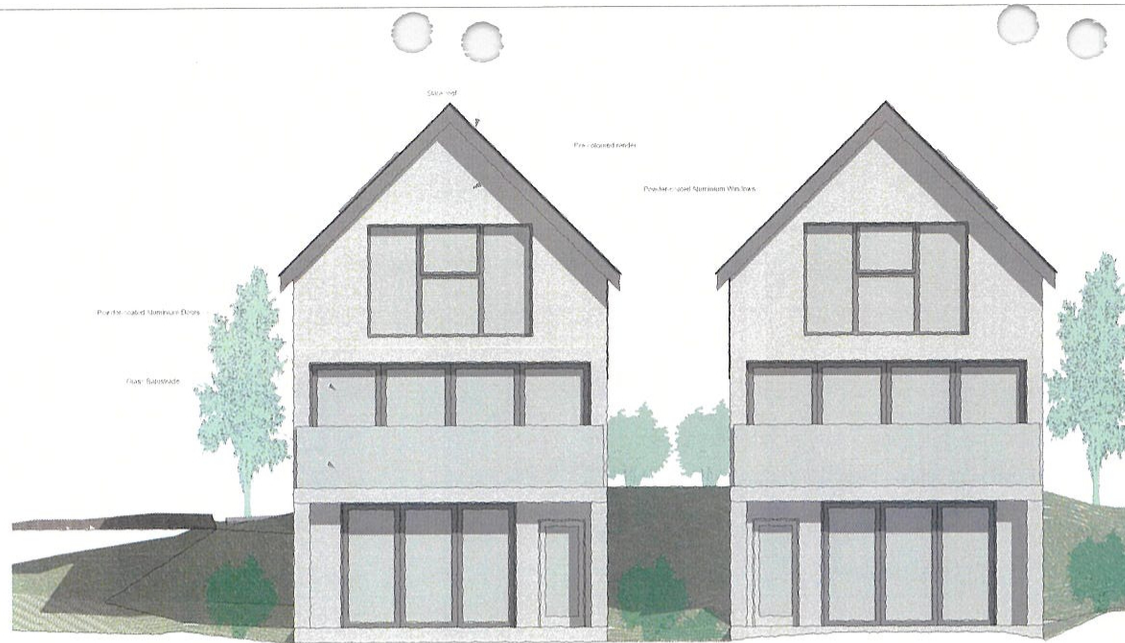
E-03 Proposed Rear Elevations 1:50