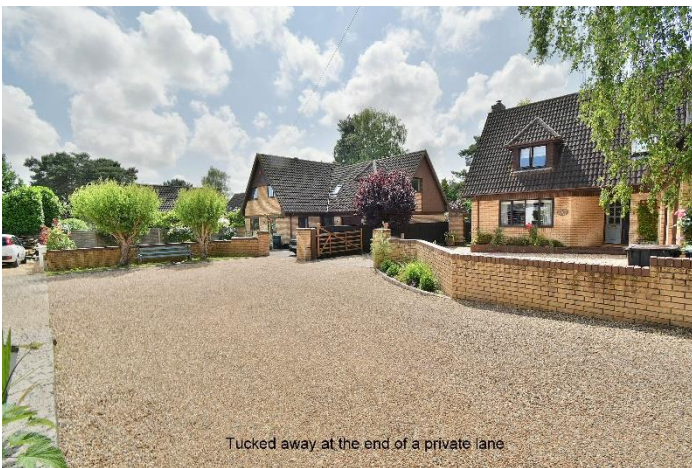
Tucked away at the end of a private lane