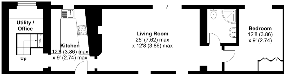
CLARENCE COTTAGE GROUND FLOOR