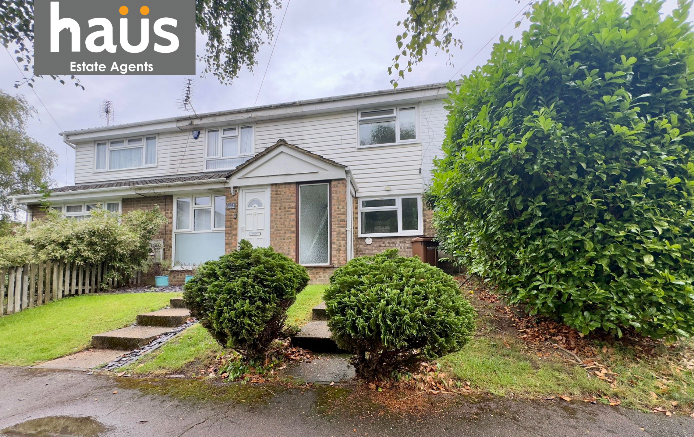
Two Bedroom Semi-Detached House Laurel Walk, Gillingham, Kent, ME8 8HU