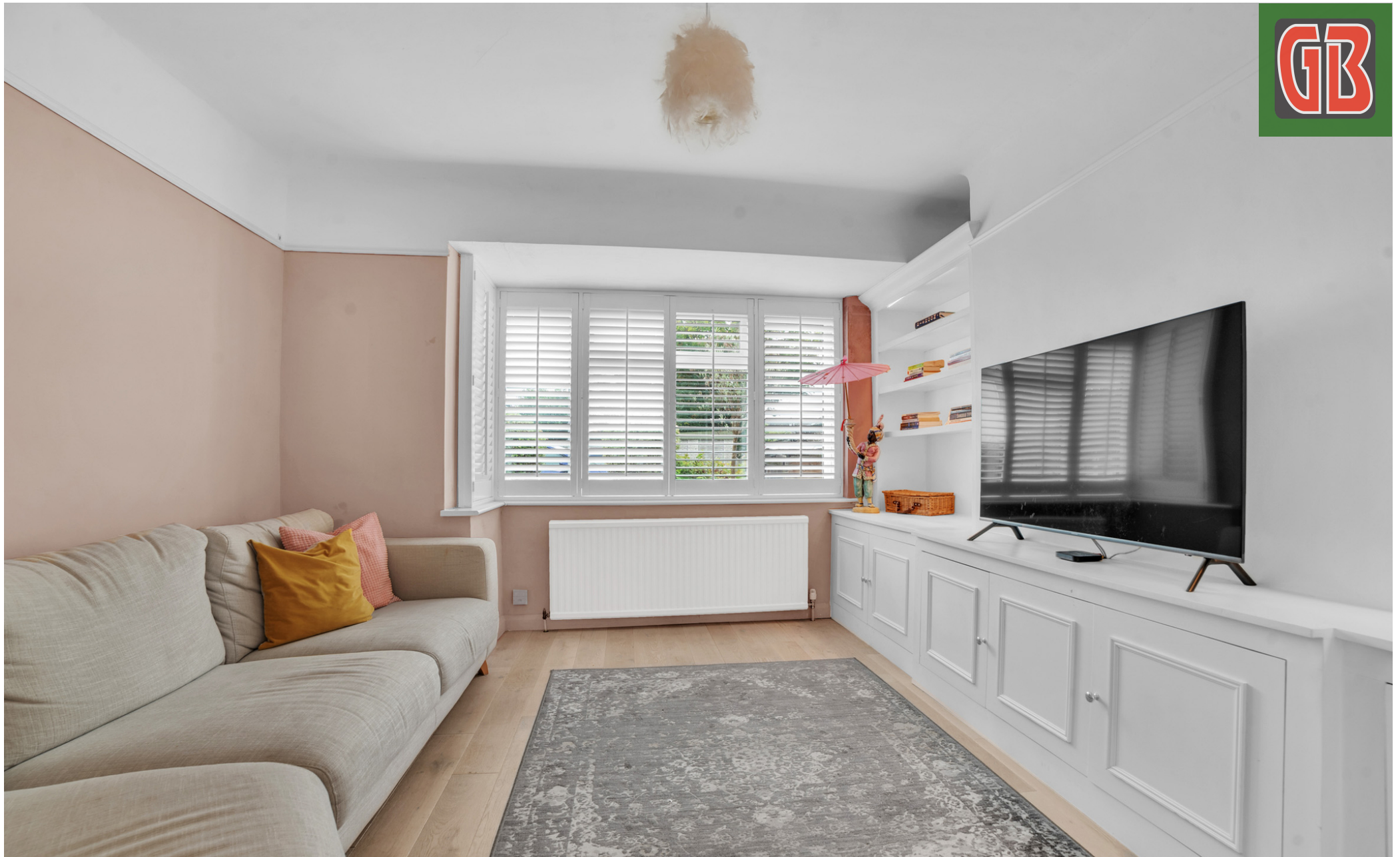
62 Stainash Crescent, Staines-upon-Thames, Surrey. TW18 1AY. 3 Bedroom Terraced House - £460,000 Freehold