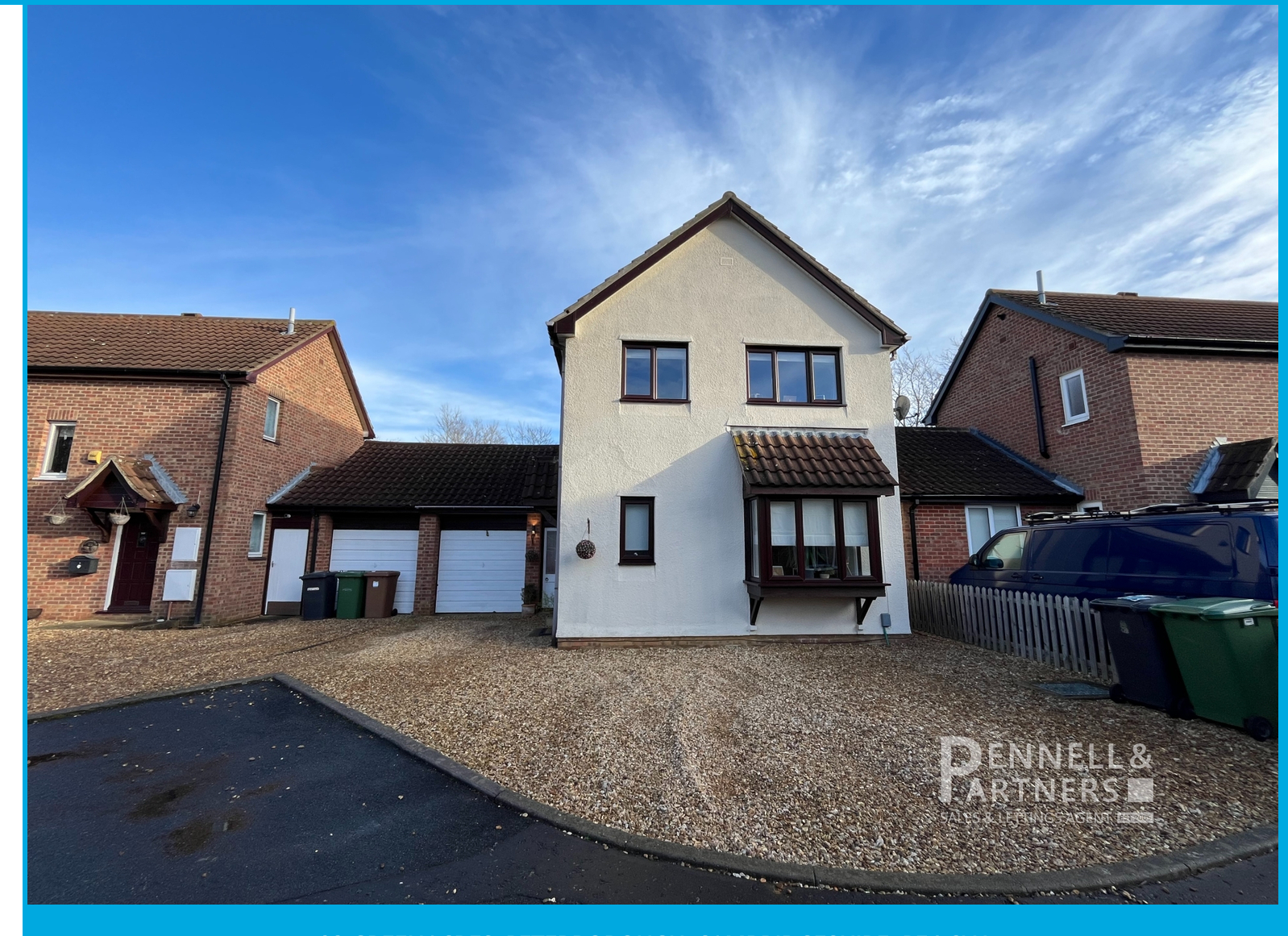
23 GREENACRES, PETERBOROUGH, CAMBRIDGESHIRE. PE4 6LH