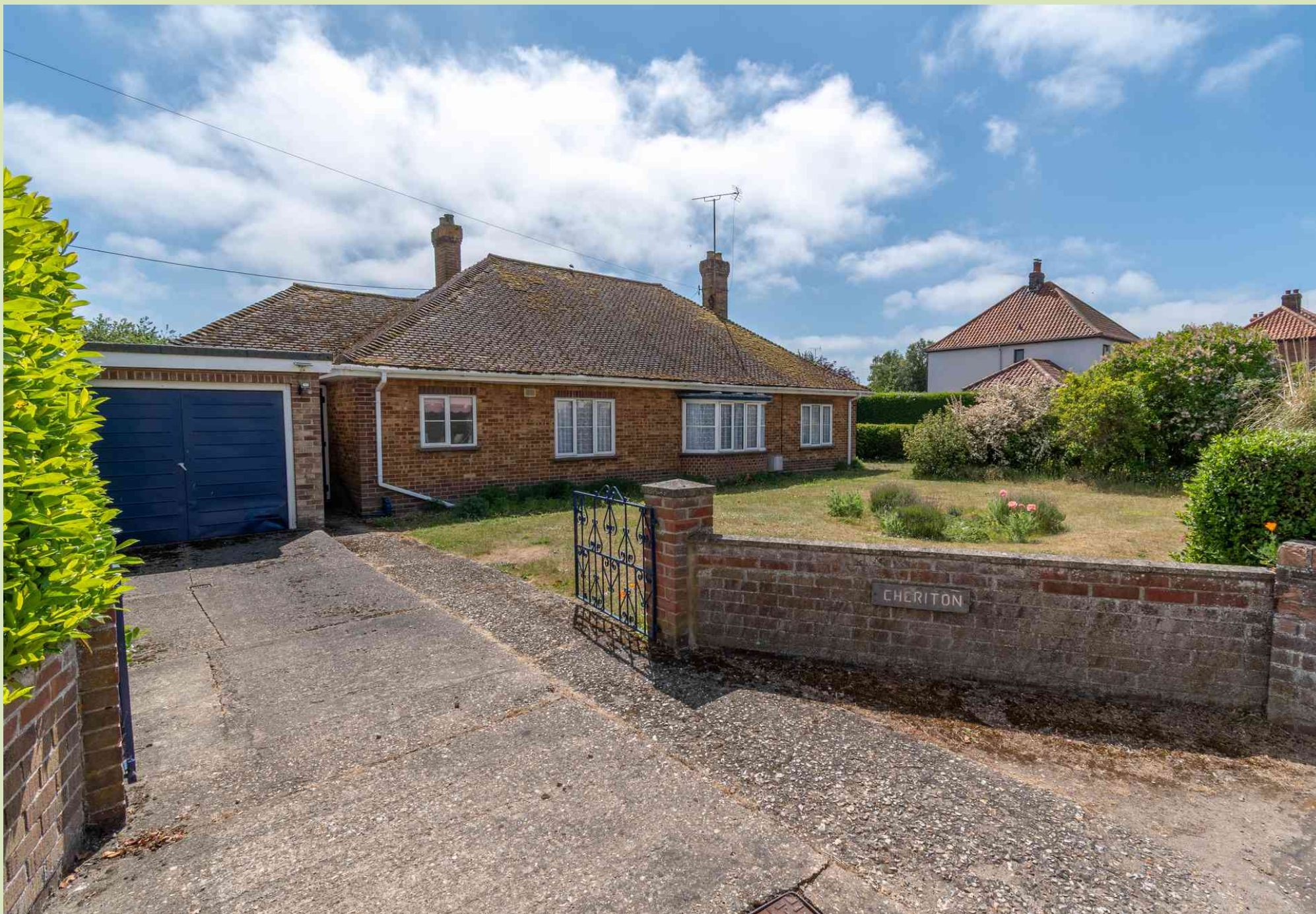
Cheriton, Wells-next-the-Sea Offers in Excess of £500,000