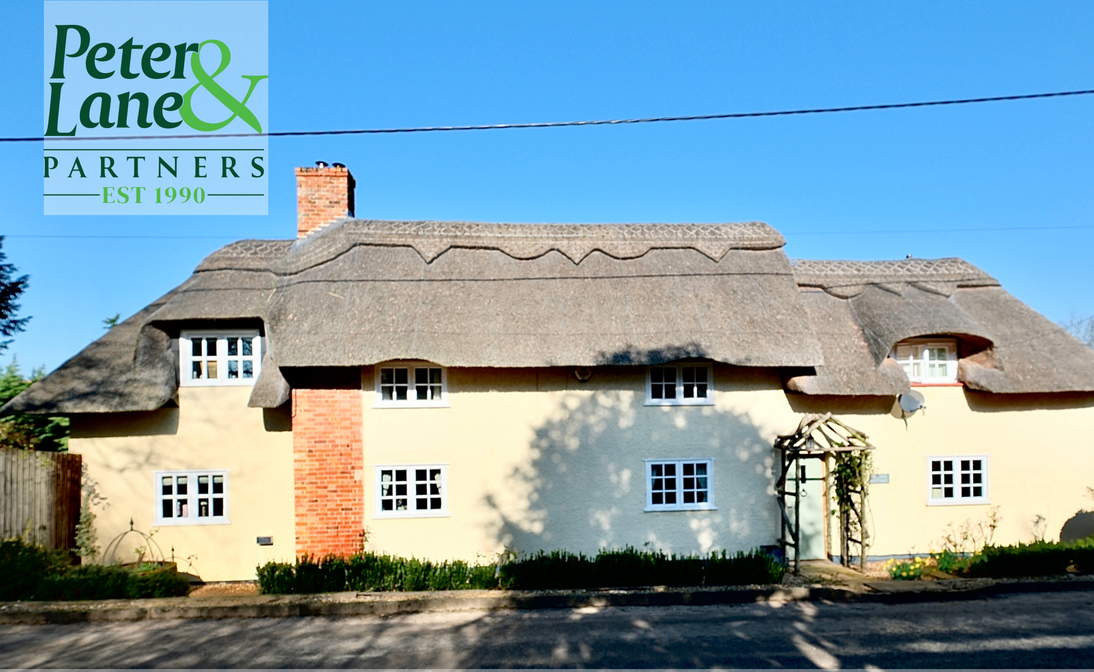
Meeting Cottage • Riseley Road • Keysoe • MK44 2HT