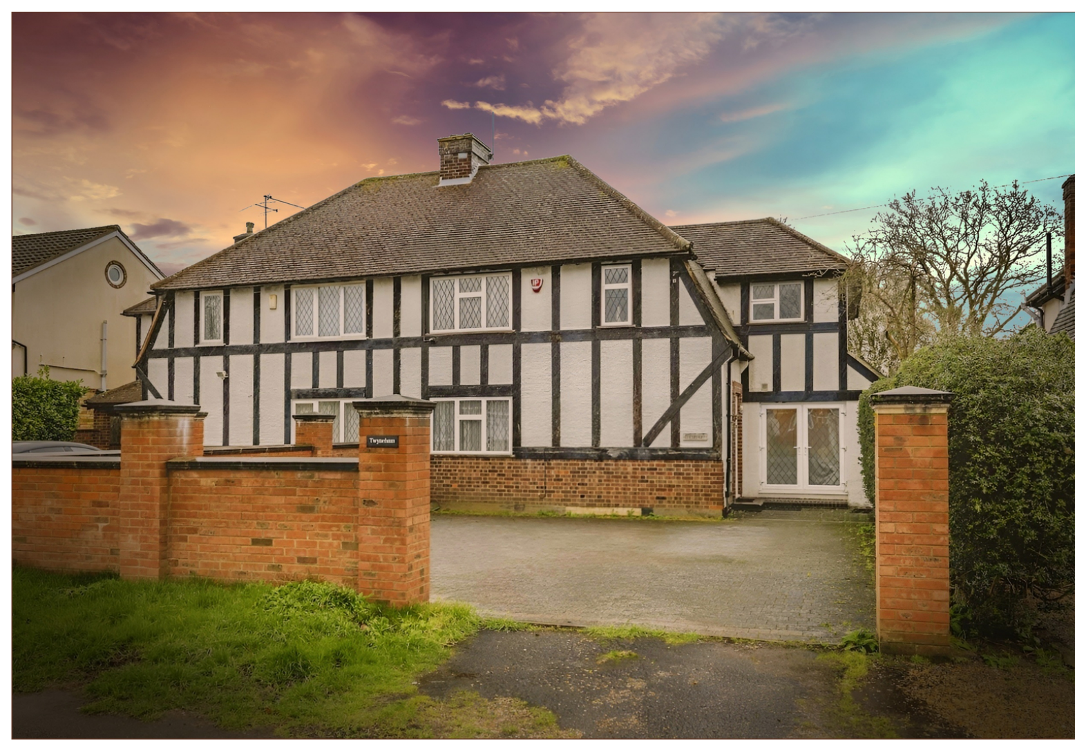
Oakwood Estates is thrilled to introduce this captivating 4-bedroom semi-detached abode, gracefully nestled within the prestigious confines of Pinewood Green. Radiating an aura of sophistication and charm, this residence embodies the epitome of refined living. With its spacious interiors, thoughtfully designed layout, and enviable location, it stands as a testament to the artistry of modern living. Ideal for discerning families yearning for a sanctuary to call their own, this property promises an unparalleled blend of comfort, convenience, and timeless allure.