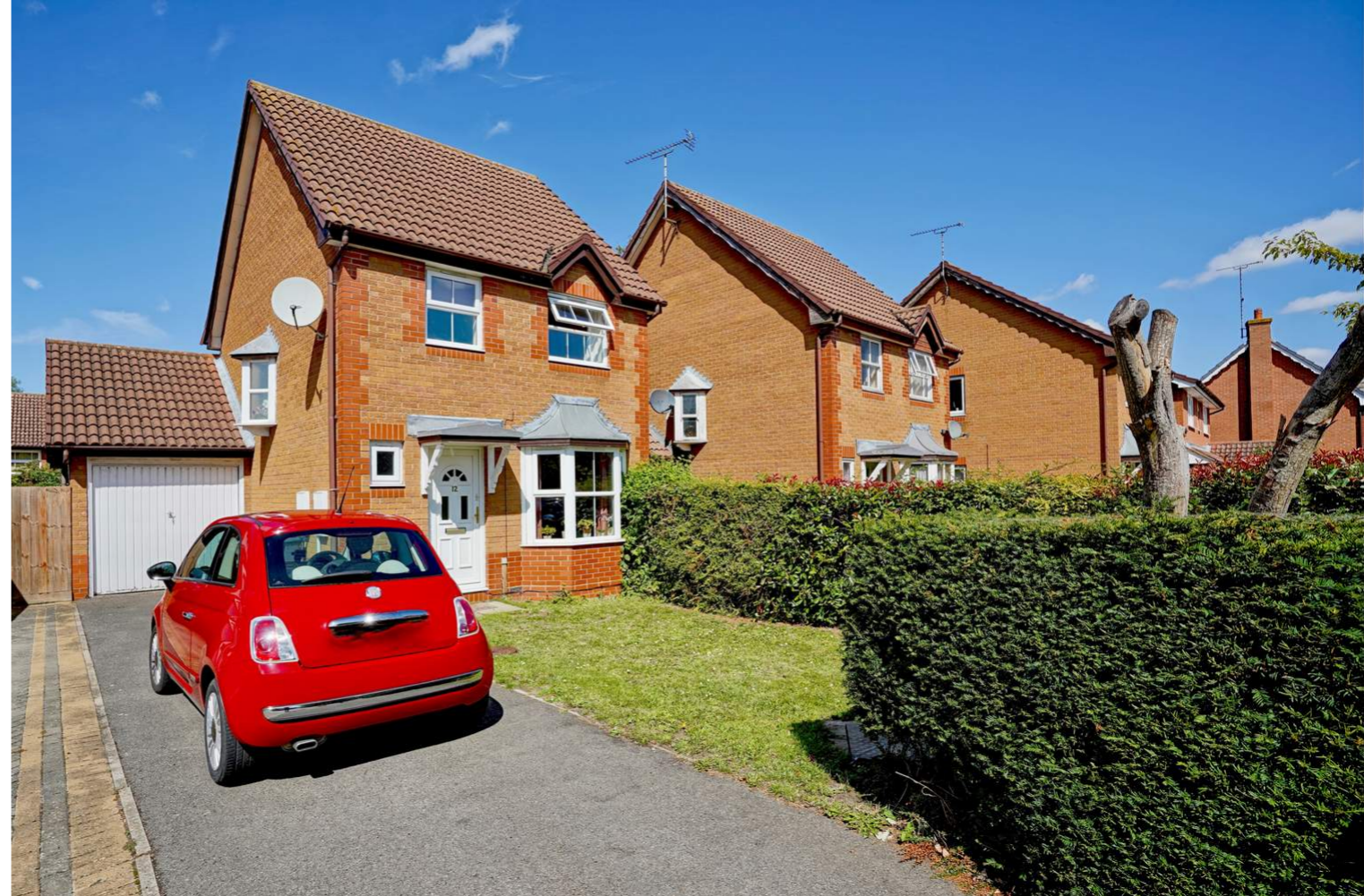
Orthwaite, Stukeley Meadows PE29 6UZ