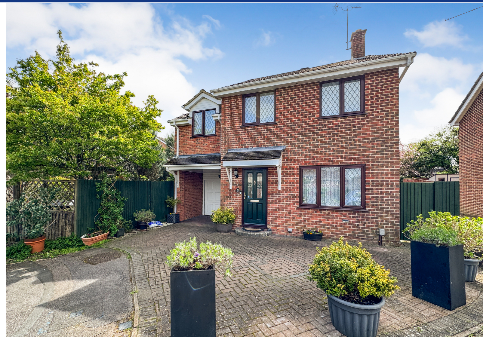
Lamorna Crescent, Tilehurst, Reading.