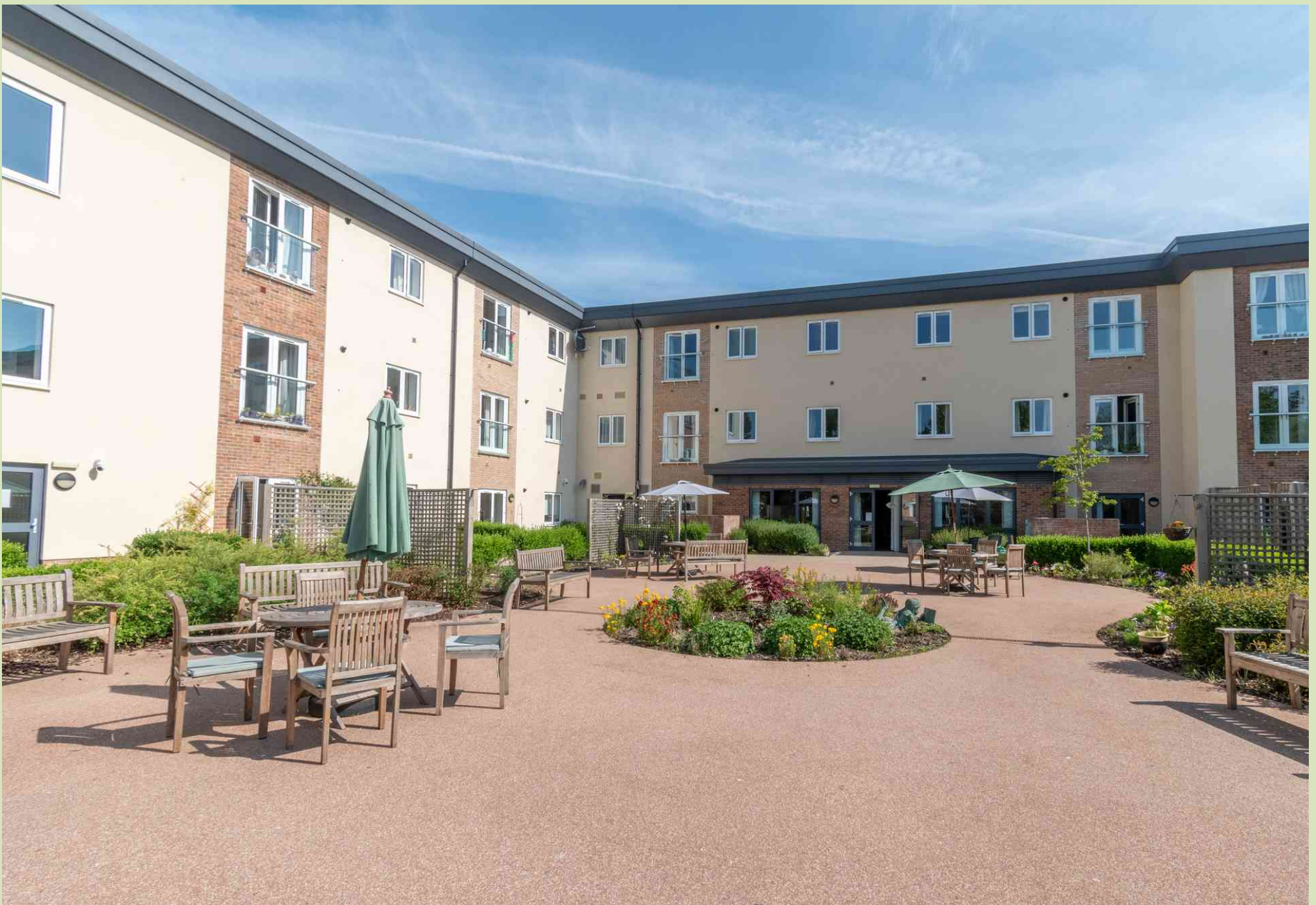
22 Meadow Walk, Fakenham Guide Price £180,000