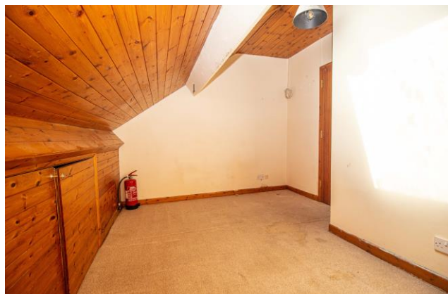
ATTIC ROOM 1

ATTIC ROOM 2 (11'4 to under eaves storage x 7') Sloping ceiling, double glazed Velux window, radiator and loft access.