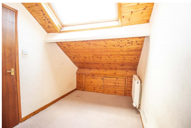
ATTIC ROOM 2

OUTSIDE Enclosed rear yard with gated access to the rear lane.