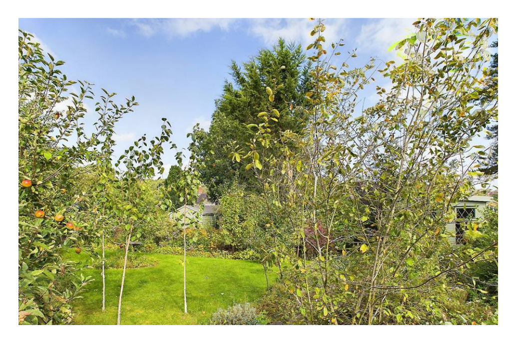
Belper Lane, Belper, Derbyshire DE56 2UG £250,000 - Freehold