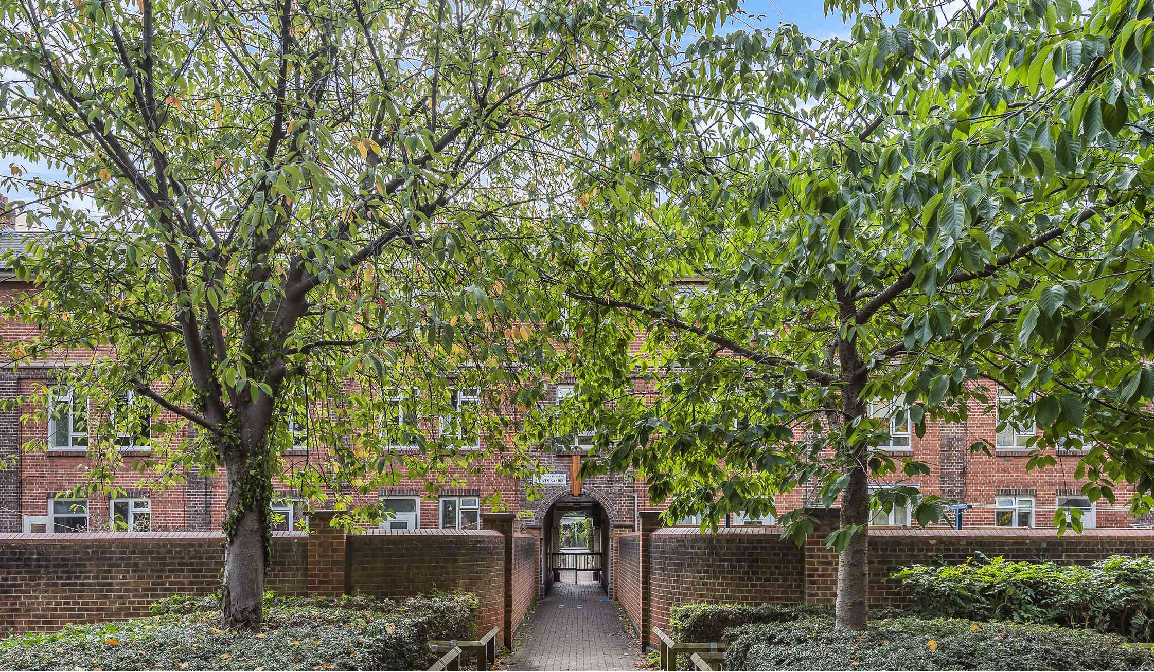
Alexandra Gardens, London, W4 2RZ