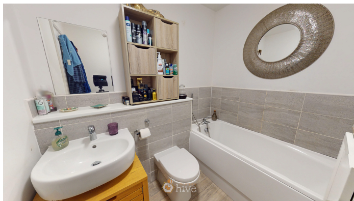
Bedroom & En Suite