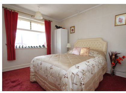
44 Mellstock Road, Oakdale, Poole, Dorset BH15 3DP