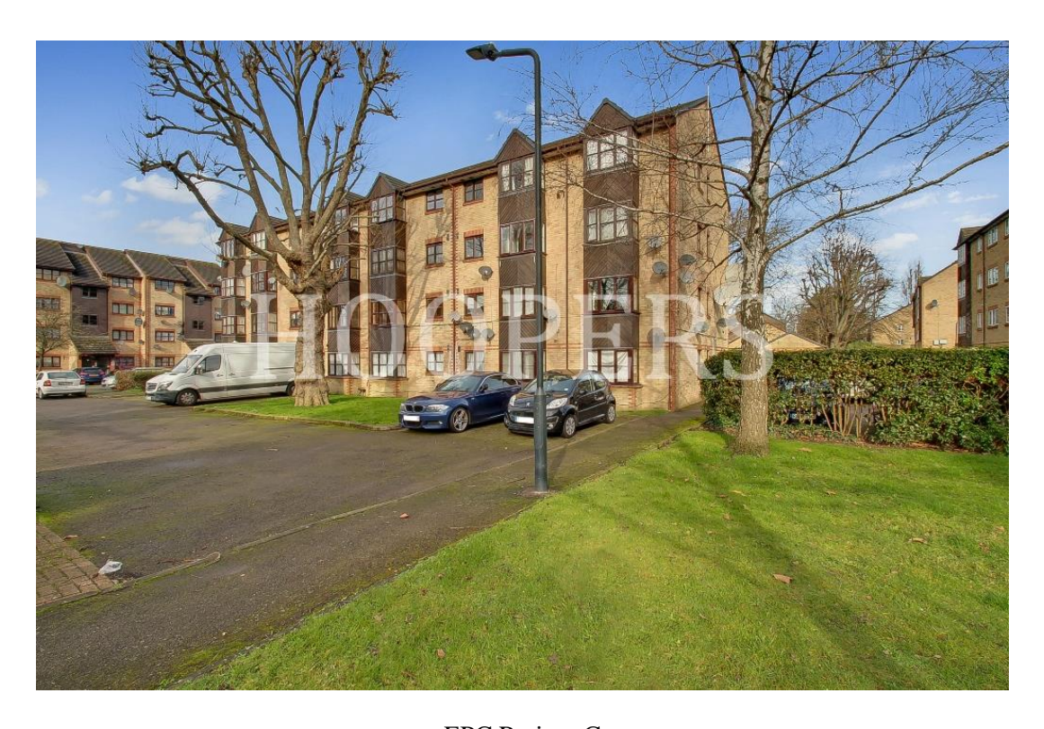
EPC Rating: C

A third (top) floor flat in this purpose built Laing development constructed circa 1990 and situated off Brentfield Road