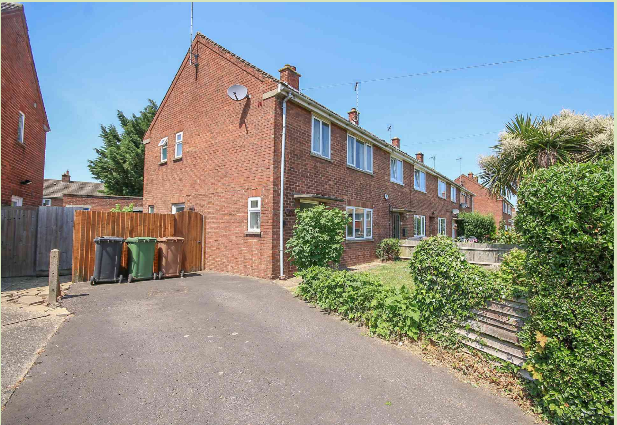
17 Alice Fisher Crescent, King's Lynn Guide Price £169,950