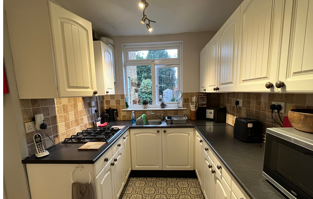
85 Station Crescent, Ashford, Surrey TW15 3HN £600,000 - Freehold