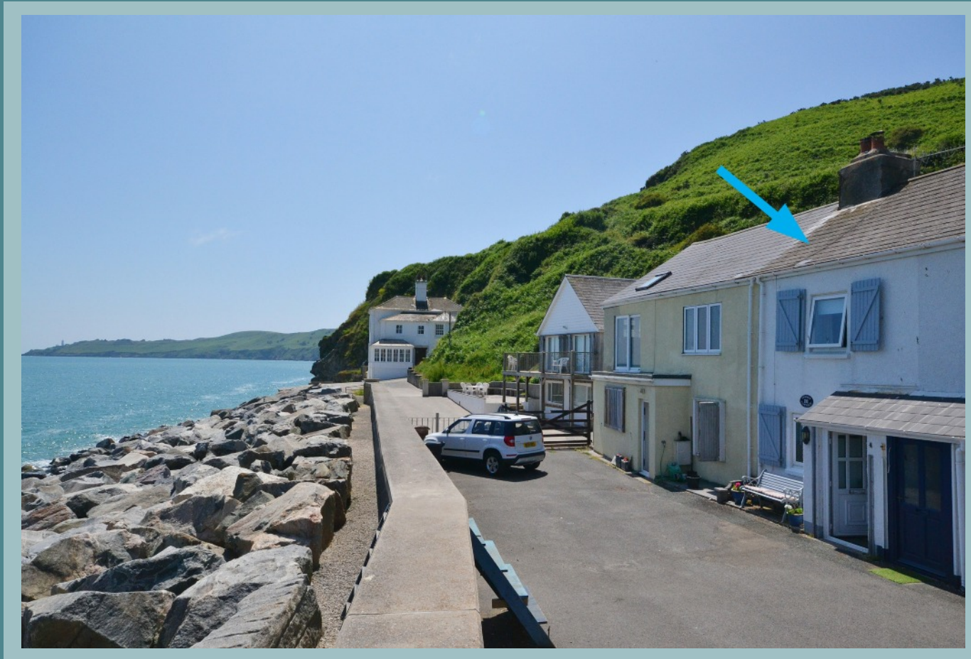
Tinsey Cottage • Beesands