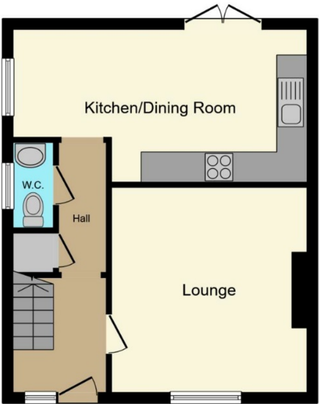
Ground Floor Floor area 41.9 m 2 (451 sq.ft.)