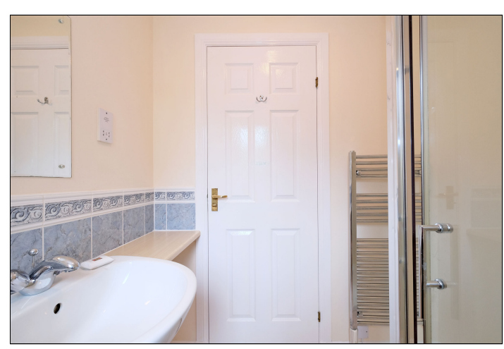
COUNCIL TAX BAND - C EPC BANDING - C