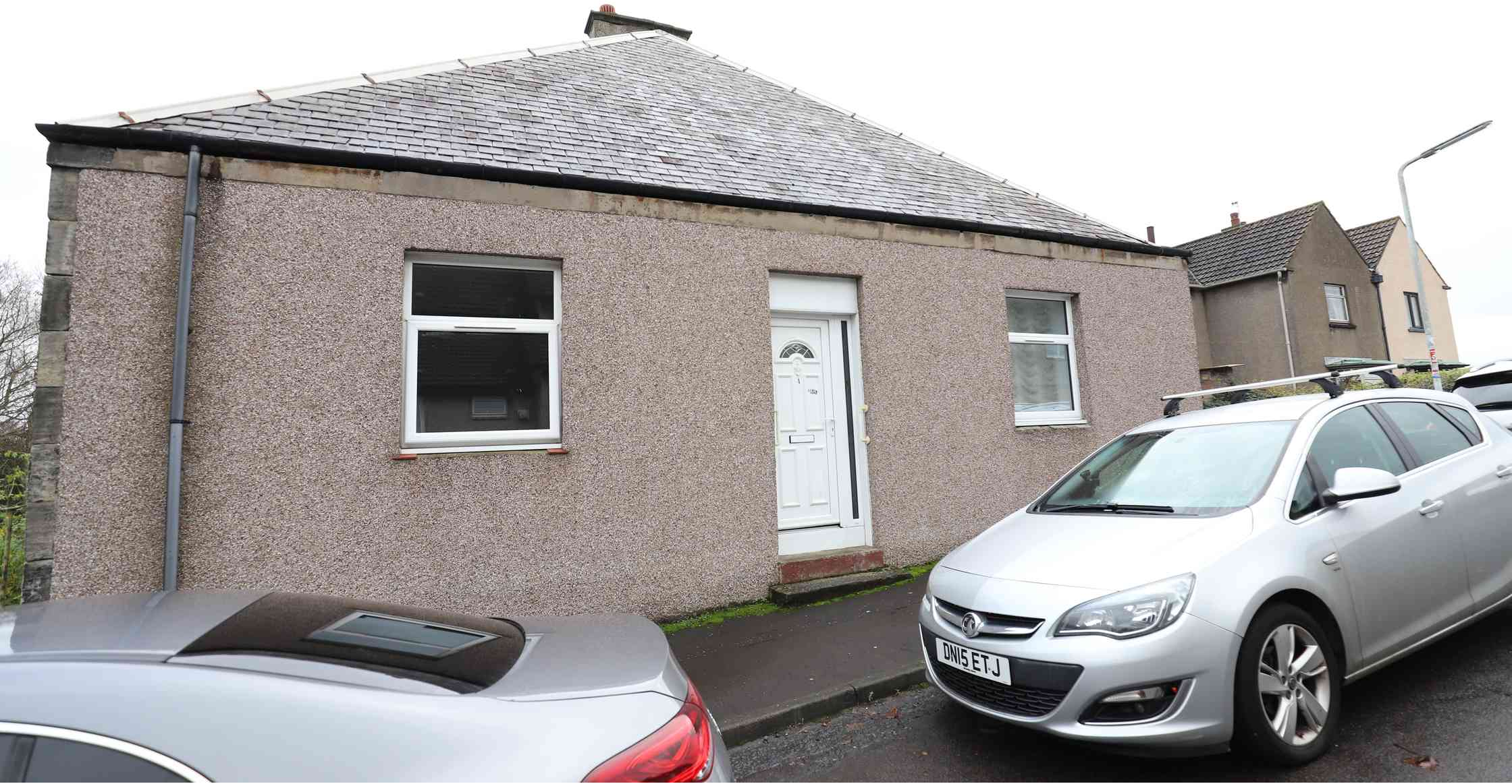
FIXED PRICE £75,000 4 Hill Street, Cowdenbeath, Fife, KY4 9AY