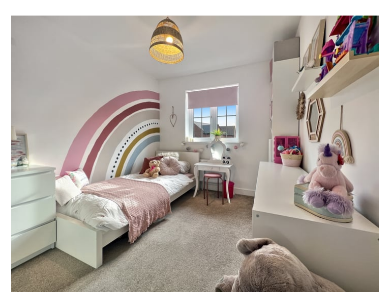
3.51m x 2.69m (11' 6" x 8' 10")