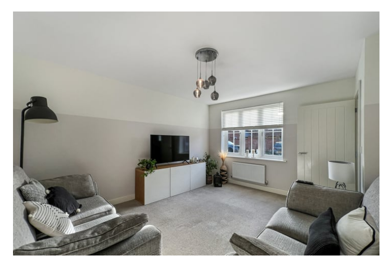
4.29m x 3.61m (14' 1" x 11' 10")