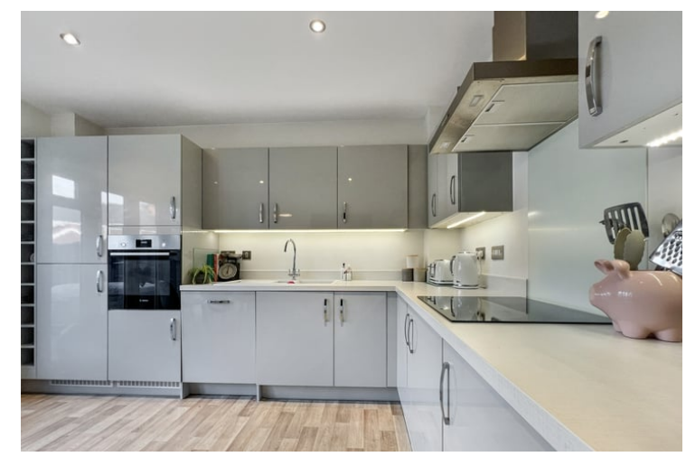
10" x 11' 11")