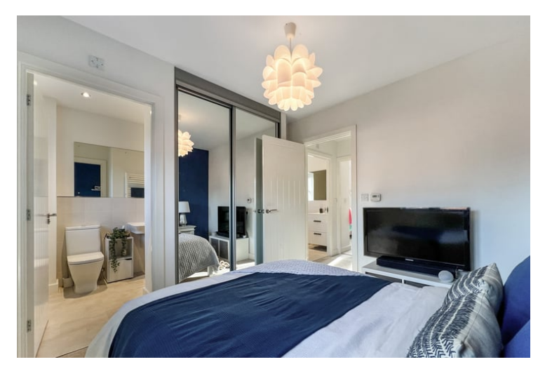
2.90m x 2.69m (9' 6" x 8' 10")