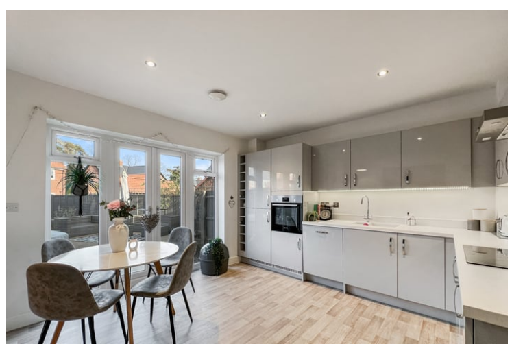
3.91m x 3.64m (12'